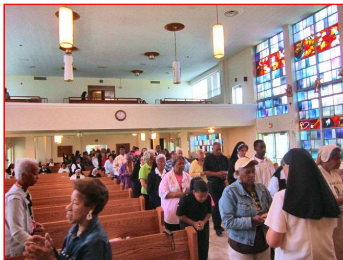
The Year of "Faith" and the "Family" was celebrated with a Mass and a picnic at the Motherhouse. Everyone enjoyed the Mass, their families, their friends, the delicious food, the fun and games.